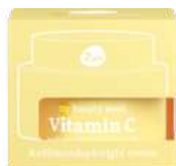
7DAYS MY BEAUTY WEEK Radiance day&night cream VITAMIN C, 50 ml