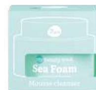
7DAYS MY BEAUTY WEEK Mousse cleanser SEA FOAM, 50 ml