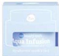
7DAYS MY BEAUTY WEEK Hyaluronic mask 2in1 AQUA INFUSION, 50 ml