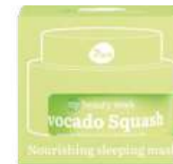
7DAYS MY BEAUTY WEEK Nourishing sleeping mask AVOCADO SQUASH, 50 ml