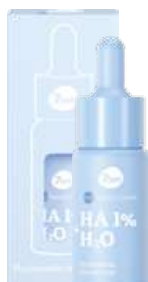
7DAYS MY BEAUTY WEEK Hyaluronic face serum HA+H2O, 20 ml