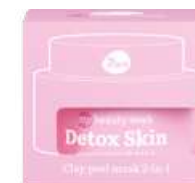
7DAYS MY BEAUTY WEEK Clay peel mask 2in1 DETOX SKIN, 50 ml