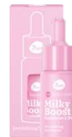
7DAYS MY BEAUTY WEEK Revitalizing face serum MILKY BOOST SQUALANE, 20 ml