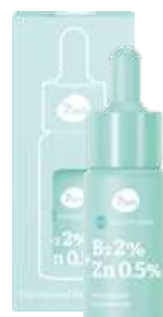
7DAYS MY BEAUTY WEEK Oil control face serum B3+ZN, 20 ml