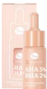
7DAYS MY BEAUTY WEEK Exfoliating peeling face serum AHA+BHA, 20 ml