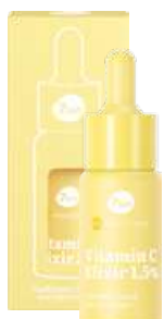
7DAYS MY BEAUTY WEEK Radiance facial serum+toner VITAMIN C ELIXIR, 20 ml