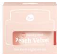
7DAYS MY BEAUTY WEEK SOS day&night cream PEACH VELVET, 50 ml