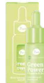
7DAYS MY BEAUTY WEEK Nourishing oil face serum GREEN POWER VITAMIN E, 20 ml