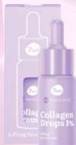
7DAYS MY BEAUTY WEEK Lifting face serum COLLAGEN DROPS, 20 ml